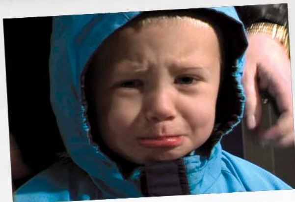
Nashville child who spent two years away from home because of his mother's meth addiction. He is now back at home, and his mother has been clean for a year and a half.

The impact of meth goes far beyond just the people who use and make it. A habitual meth user becomes irritable, paranoid and often violent. Usually, the first to pay the price is the addict's family, especially the children.